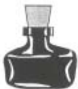
iron gall ink