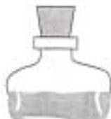
Bags and bottles of natural ingredients used for making pigments. Some natural ingredients used were lapis lazuli, saffron, parsley, cochineal and vermillion. When ingredients have been mixed and are in liquid form, they are kept in corked bottles until needed again.