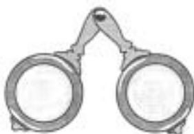
eyeglasses for magnifying small details.