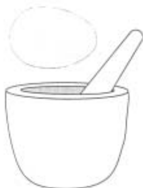
egg white or egg glair used for mixing with powdered pigments in mortar and pestle.