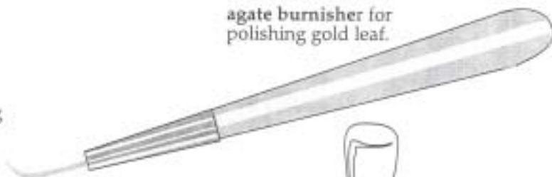
agate burnisher for polishing gold leaf.